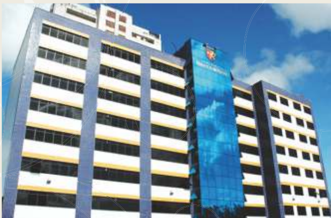
Recife - PE

The Group boasts an infrastructure planned for the development of academic and administrative activities, well adapted to university life and services. Ser Educacional Group is attentive to changes in the contemporary world, and to technological advances, investing considerably in resources to offer students, faculty and staff the best and most stimulating university experience possible. The facilities are a national reference; modern structures with technical resources, air-conditioned classrooms, wireless networks, laboratories, studios, workshops, libraries, clinics, cultural spaces, bookstores, auditoriums, sports gymnasiums, aquatic facilities, refectories, and accessibility for those with special needs.