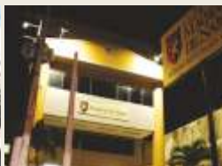
Natal - RN