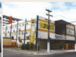
Maceió - AL