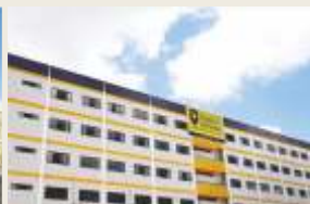
Campina Grande - PB