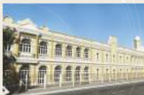
Fortaleza - CE

The Group boasts an infrastructure planned for the development of academic and administrative activities, well adapted to university life and services. Ser Educacional Group is attentive to changes in the contemporary world, and to technological advances, investing considerably in resources to offer students, faculty and staff the best and most stimulating university experience possible. The facilities are a national reference; modern structures with technical resources, air-conditioned classrooms, wireless networks, laboratories, studios, workshops, libraries, clinics, cultural spaces, bookstores, auditoriums, sports gymnasiums, aquatic facilities, refectories, and accessibility for those with special needs.