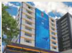
João Pessoa - PB