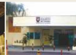
Salvador - BA